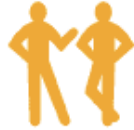
People Smart (Interpersonal)