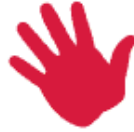
Body Smart (Bodily-Kinesthetic)